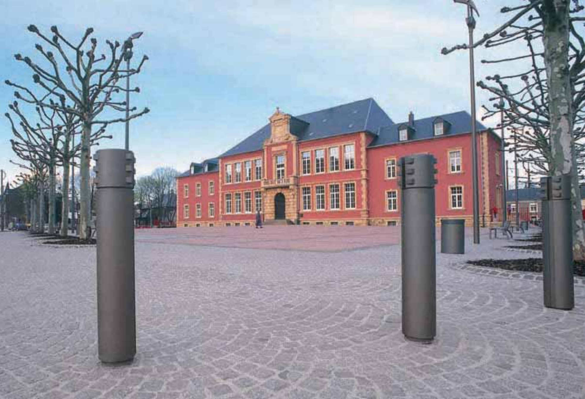
POLARIS DIFFERDANGE . LUXEMBURG